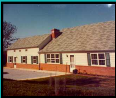
The new house in Cockeysville. Adine thought it looked a bit like an airplane hanger, outside, but loved the inside...