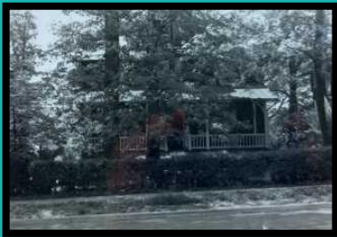
4134 Roland Avenue