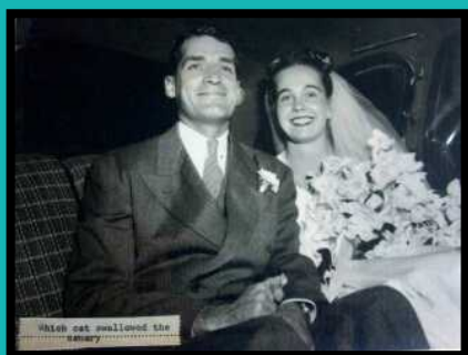
October 26, 1946 "I was so happy..."