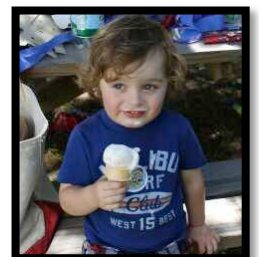
The ice cream, of course was a big hit....