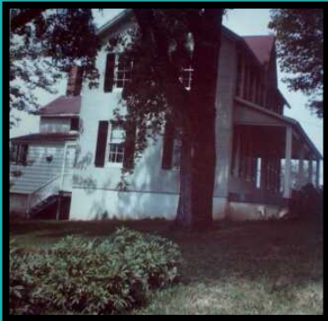
The old farmhouse in Cockeysville