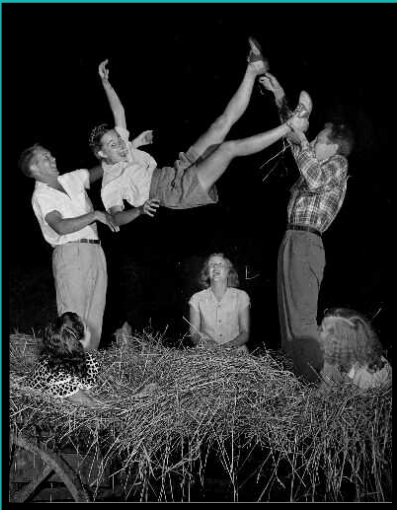
“The Hayrides were always great times.... These photos were all posed of course...”