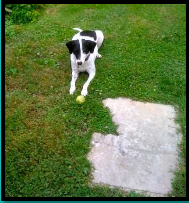
In Memory of Annie the Dog 2002-2014