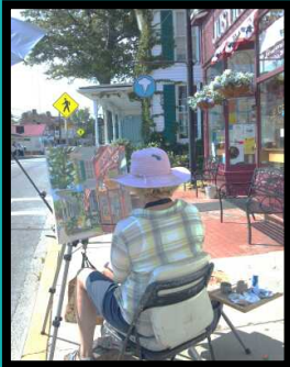
Good to know that Claiborne is part of the Essence of St. Michaels....