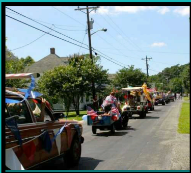
It was really long....