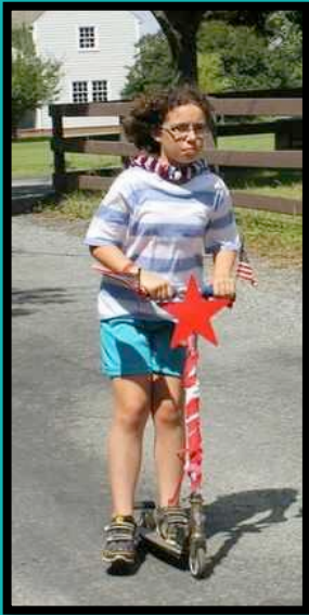
All kinds of vehicles joined in...