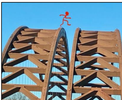
D. The leap of faith