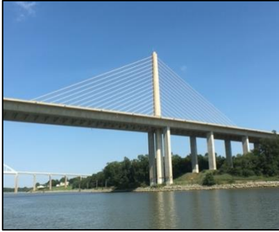
A. The light touch