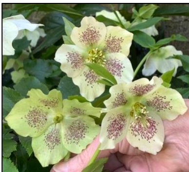
Magnolia and Hellebore