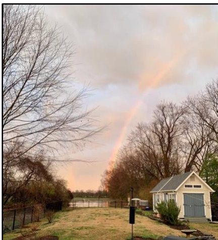
No pot of gold but maybe an early Spring sign of good things to come – Rob Todd