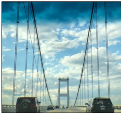
B. The copy cat