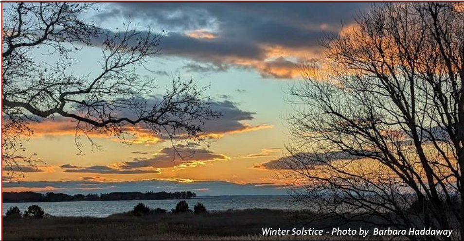
Winter Solstice